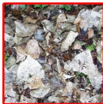
Leaves, Mulch and Compost