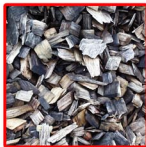
Wood Chips and Shavings