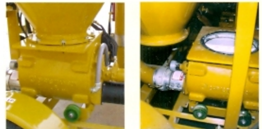
Service the airlock tips in minutes with the VacBoss exclusive Airlock Truck™ Access System.