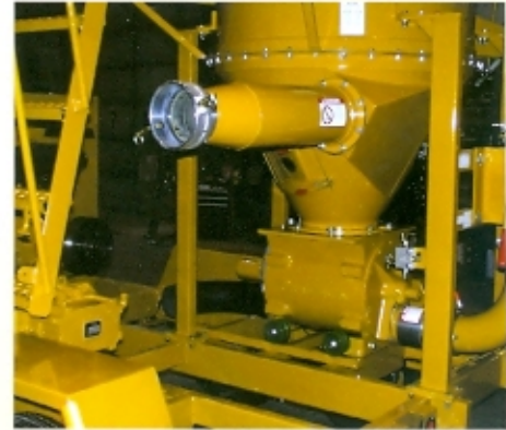
The RVI™ offers a multitude of benefits, such as increased performance and reduced wear.