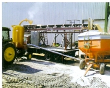
Weighing the grain for accurate capacity ratings.

last two years, VacBoss™ has gone through a rigorous testing process. The VacBoss™ has been subjected to the harshest of conditions, including endurance tests where the VacBoss™ was run 24-hours a day for days on end. Dirty, moldy grain was conveyed to test the BlowerGard™ Filtration system. Handling damage and power requirements were monitored.