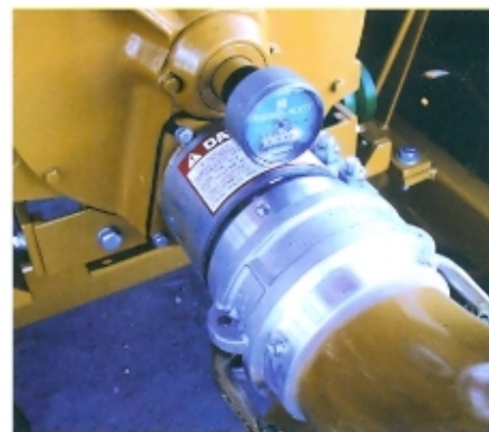
The camlock coupled lower elbow can easily be removed for blowing applications where the truck loading kit is not used.

The camlock coupled lower elbow can easily be detached without tools in applications where the truck loading kit is not used—such as filling bins, silos, and bunkers. Camlock couplers provide sure alignment and positive seal at every connection.