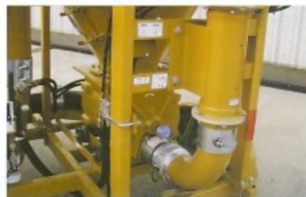
Heavy-duty bearings hold the truck loading kit securely in place during unloading.

The hydraulic truck loading kit allows truck loading from the side, corner, or rear with a clearance of 12' 2". The Truck Loading Kit is hydraulically raised and lowered at a touch of a lever. It features heavy-duty bearings to rigidly hold the truck loading kit during unloading.