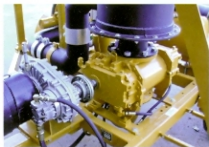
The gearbox delivers smooth, direct power to the blower and hydraulic pump.

The fuel efficient, water-cooled diesel engine features a dual element air filter system, engine shroud, high ambient radiator, and city critical exhaust muffler. The engine package comes complete with a 60 gallon (227 liters) fuel tank with gauge and full safety instrumentation in a lockable enclosure.