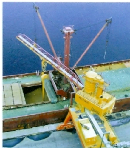
Christianson's equipment is used worldwide, including grain ship unloaders.

Christianson's product line is extensive and ranges from small bulk seed conveyors to large ship unloaders for discharging ocean-going vessels. Christianson offers equipment under the brand names of SuperTower®, Chem-Vac®, Handlair®, Vac-u-Vator®, and Seed Vac™. Christianson has focused on providing innovative, reliable, high-quality equipment by investing in the latest computer-aided-design technology.